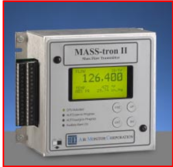
*Shown with standard 4-line graphic LCD

Pressure Compensation. Absolute pressure (atmospheric or duct static), up to 60 IN Hg.