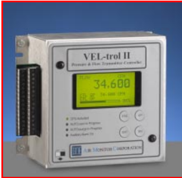
*Shown with optional 4-line graphic LCD

The VEL-trol II incorporates a controller into the ultra high accuracy VELTRON II transmitter, providing the three modes of proportional, integral reset, and inverse derivative to permit the controller to be tuned to the extreme dynamics of critical airflow and pressurization control processes. The selection of the P,I,1/D tuning parameters is accomplished using the password protected membrane switch pushbuttons on the front of the enclosure. By means of a dry contact input, the controller operating set point can be switched from the internal fixed setpoint to an externally provided fixed or variable input.